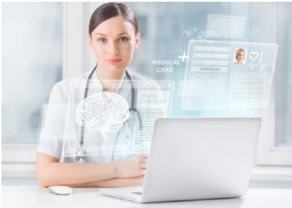
Photo caption coreribus a imod mil maximint dolestionse liqui tem nus eiu? In nectat excerum aut quam quatemorum et ullaccus quatur? Bearion repedit, tem core perioreperum untur.

Body Text Lorem ipsum dolor sit amet, consectetur adipiscing elit, sed do eiusmod tempor incididunt ut labore et dolore magna aliqua. Ut enim ad minim veniam, quis nostrud exercitation ullamco laboris nisi ut aliquip ex ea commodo consequat. Duis aute irure dolor in reprehenderit in voluptate velit esse cillum dolore eu fugiat nulla pariatur. Excepteur sint occaecat cupidatat non proident, sunt in culpa qui official deserunt mollit anim id est laborum.